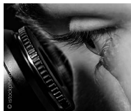
Four new drugs to be risk assessed in the wake of rising health concerns.

Following the meeting of the Scientific Committee in April, four risk-assessment reports will be submitted to the European Commission and the Council of the EU. On the basis of these