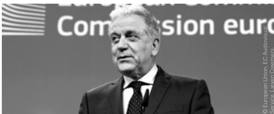
Dimitris Avramopoulos: 'Over 93 million Europeans have tried an illicit drug in their lives and overdose deaths continue to rise for the third year in a row'.

Speaking on the occasion of the report launch, Dimitris Avramopoulos, European Commissioner for Migration, Home Affairs and Citizenship, said: 'The impact of the drugs problem continues to be a significant challenge for European societies. Over 93 million Europeans have tried an illicit drug in their lives and overdose deaths continue to rise for the third year in a row. I am especially concerned that young people are exposed to many new and dangerous drugs. Already 25 highly potent synthetic opioids were detected in Europe between 2009 and 2016, of which only small volumes are needed to produce many thousands of doses, thus posing a growing health threat. The annual European Drug Report gives us the necessary analysis, guidance and tools to tackle this threat together across Europe, not just to protect the health of our citizens, but also to stop huge profits