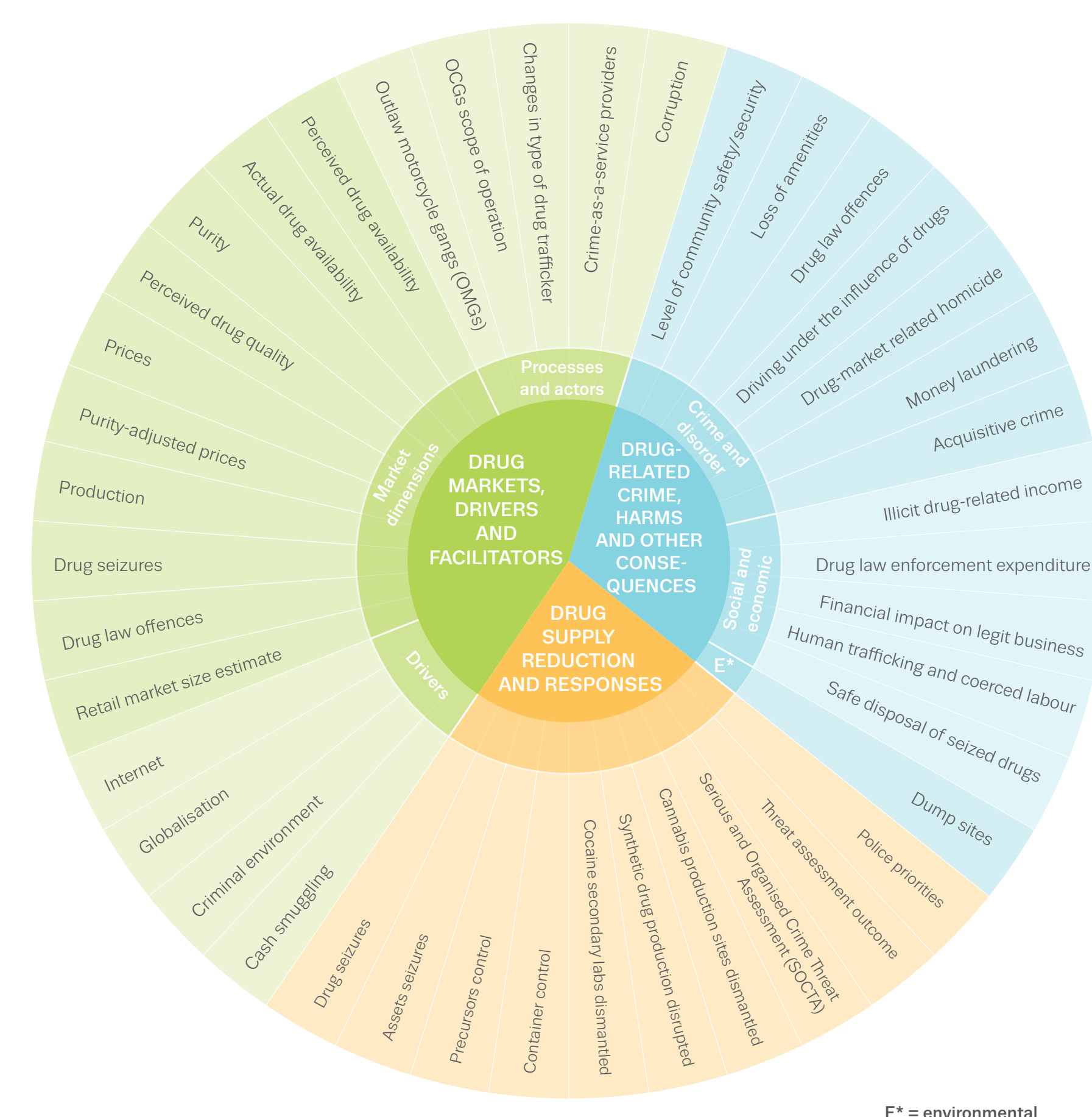
FIGURE 2 | Thematic areas, domains and potential indicators

and demand curves, as captured in the standard economic market diagram (Figure 3). The supply curve can shift for reasons other than policy interventions; for example, a drought in Afghanistan may raise the farm-gate price of opium, which may have an effect on the price of heroin along the supply chain.