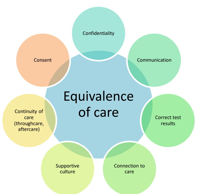
Figure 2. The seven Cs

In accordance with recognised international standards [53,54,114], active case finding should be voluntary and based on informed consent. People who get tested, including people in prison, would need to be informed about the testing procedures and their right to decline testing. Regardless of whether the offered interventions are opt-in or opt-out, seeking consent for testing would need to take into account that people in prison often feel vulnerable and disempowered. This is often aggravated by language problems, developmental and educational deficits, and poor social skills [51,53]. It is therefore advisable to train staff members (e.g. physicians, nurses), support staff (e.g. from non-governmental organisations) or peers in counselling. Legal parameters for consent may differ between countries; national requirements should be taken into account when designing testing programmes.