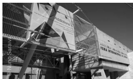
Goulão: 'Now is a unique moment to establish a leading international forum on addictions.'

'Addiction science in Europe is of growing policy relevance, becoming more mature in respect to capacity and quality and more influential in respect to its findings. Despite this, no multidisciplinary forum has existed until now to allow scientists working in the addictions area to share knowledge, to network and to present their latest findings...Now is a unique moment to establish a leading international forum on addictions'.