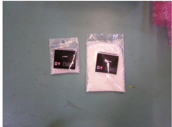
FIGURE 4 Two bags containing \alpha -PHP and FUB-AMB seized at the Customs Post Office in Belgrade in 2017