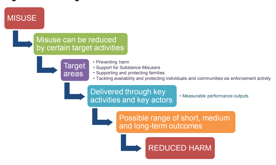
Figure 5.2: 2008 Logical Framework