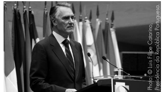
President of Portugal, Aníbal Cavaco Silva, at the closing session.