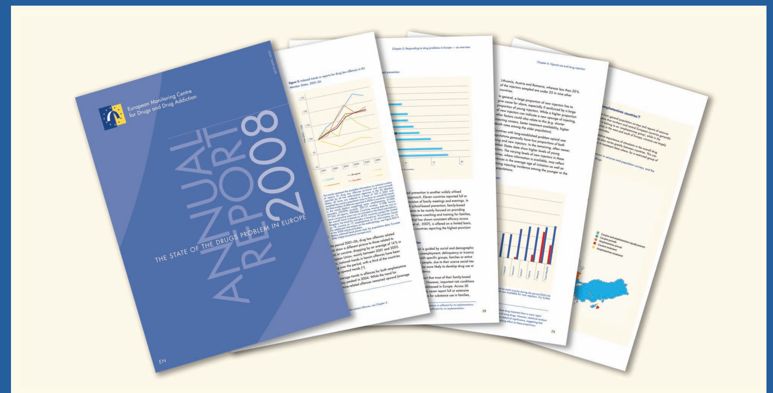
Overview of the drug phenomenon in some 30 European countries

Individual chapters dedicated to specific drugs explore the latest developments in supply and availability; prevalence and patterns of use; health effects and interventions. Also detailed in the report are the legal, political, social and health responses to drugs applied across Europe today.