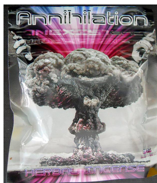
'Annihilation': a so-called 'legal high' that led to hospitalisations in Europe. Analysis of samples found different combinations of synthetic cannabinoids, some of which are controlled drugs in some countries.