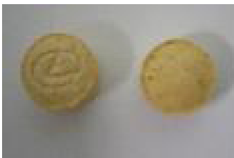
Tablets resembling 'ecstasy' found to contain 5-(2-aminopropyl) indole (5-IT).

A recent EU survey in young people aged 15–24 found that lifetime use of 'legal highs' in most Member States was 5 % or less, with use in the United Kingdom, Latvia, Poland and Ireland being 8 %, 9 %, 9 % and 16 % respectively.